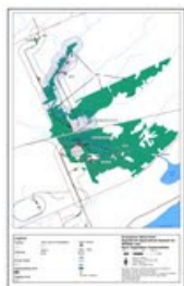
ABH Survey Locations _2013-04-11.jpg