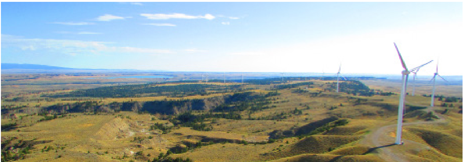
Image shows generic wind turbines, not the Siemens 5.0 MW turbine.