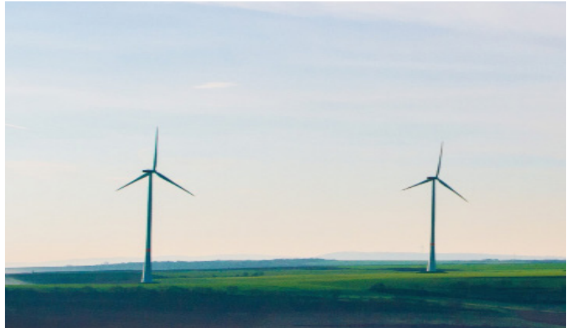
Image shows generic wind turbines, not the Siemens 5.0 MW turbine.

SRELP has made some organizational changes since Q4 2019. Potentia Renewables Inc. purchased Greengate Power Corporation's ownership in the SWP. SRELP is now owned by Potentia Renewables Inc. and Paul First Nation Renewable Energy Limited Partnership. The Paul First Nation Renewable Energy Limited Partnership have a minority stake in the SWP while Potentia Renewables Inc. continues to have a majority ownership of SWP. SWP II will be owned by a subsidiary of Potentia Renewables Inc. and its affiliates.